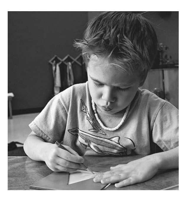
FIGURE 1.3. The Metal Insets

is a complex web of interrelationships with materials in different areas of the curriculum. As far as I know, no other single educational curriculum comes close to the Montessori curriculum in terms of its levels of depth, breadth, and interrelationship across time and topic.