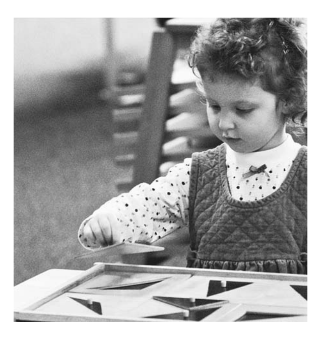
FIGURE 1.5. Triangle Tray from the Geometry Cabinet

wooden stick allows children to practice holding something pencil-like, but without the added concern of making marks that would damage the material. Children learn the names of various shapes of leaves while also (without knowing it) learning the wrist action and pencil grip for writing. Even prior to using the orange wooden stick, "The little hand which touches, feels, and knows how to follow a determined outline is preparing itself, without knowing it, for writing" (Montessori, 1914/1965, p. 96). Clear writing is exact, and such exercises prepare children by engaging them in precise movements.