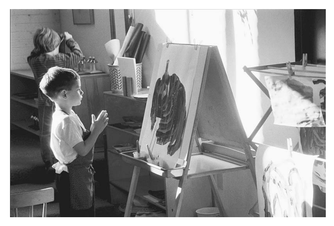
FIGURE 1.7. Montessori art: Child at easel

derful variety of creative illustrations in art, an area many people mistakenly think is not part of the Montessori curriculum (e.g., Stodolsky & Karlson, 1972; see the young artist in Figure 1.7). The same misconception is often found regarding music, although Montessori also has a full music curriculum. Not all Montessori teachers implement the full curriculum, sometimes because their training courses are of insufficient duration to cover it. Indeed, Dr. Montessori used two years to teach the Elementary curriculum to teachers, whereas the longest-running Elementary training courses today teach it in a year.