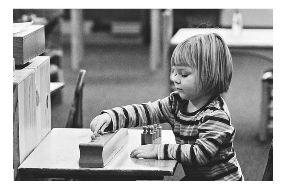
FIGURE 1.4. The Wooden Cylinders

both height and width together. The fourth decreases in width and increases in height. The exercise of lifting the cylinders out, mixing them up, and then returning them to their appropriate holes was designed primarily to educate the child's intelligence by engaging the child in an activity requiring that he or she observe, compare, reason, and decide (Montessori, 1914/1965). Focusing on dimension with this exercise also prepares the child for math, and the work enhances the child's powers of observation and concentration. But the addition of the knobs allowed the material to confer two additional benefits geared toward writing: strengthening the finger and thumb muscles and developing the coordination needed for holding a pencil.