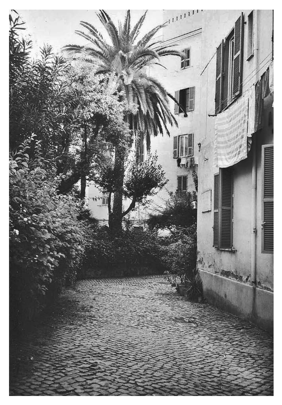
FIGURE 1.1. The Casa dei Bambini today at the original location, at 58 Via dei Marsi near the University of Rome.