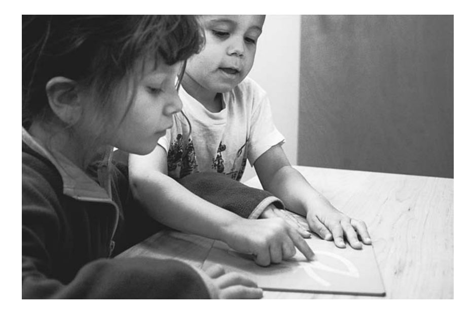
FIGURE 1.8. The Sandpaper Letters

trace the letters (shown in Figure 1.8), children learn to say the phonetic sound (not the name) associated with each letter.<sup>3</sup> Later, the Metal Inset and Sandpaper Letter activities come together. Children hold pencil to paper while making the same hand motions they made with the Sandpaper Letters, saying the sounds of the letters, and eventually stringing letters together to write words in cursive. This process is also assisted by the provision of the Movable Alphabet, a wooden box of cardboard letters that children use to make words (shown in Figure 4.4).